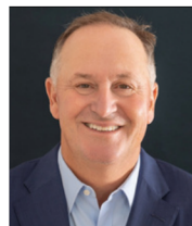
Rt Hon Sir John Key

Chief Operating Officer at MoneyMatch (Malaysia)